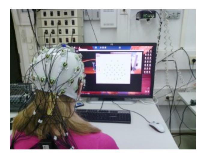
Figure 1. EEG equipment used in research on skill learning.

Figure 1 shows the research setting of the skill learning experiment. EEG measurements were performed before and after learning a specific textile craft skill. Electrodes were placed at various locations on participants' scalps to measure the voltage of synchronous electrical activity of neurons at those locations. During measurements, participants' brain responses were recorded using a NeurOne EEG-instrument (Mega Electronics Ltd, Finland) with 32 EEG and EOG channels. The EEG procedure enables illustrating brain activity during real-time viewing and action and is non-invasive and much less cumbersome than other brain imaging systems.