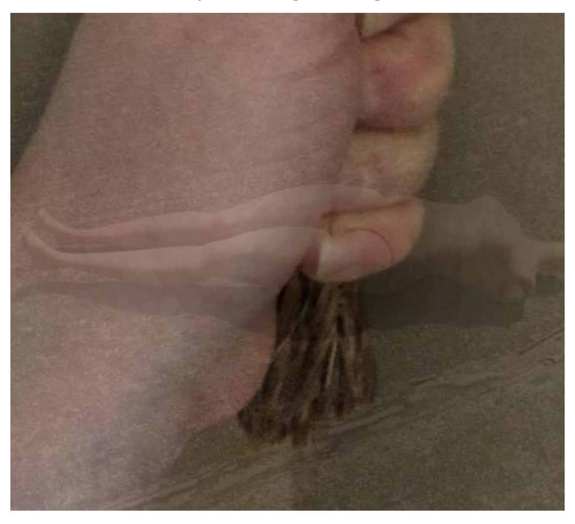
Chapter 3: Losing Your Religion

And, so, here I am in the corner. Losing my religion. Trying to keep up with the academy. And, it isn't just me in the corner. It isn't just a dream. I heard so many friends laughing, singing, crying, flying...trying. I heard them over phone lines crossing many miles, sometimes oceans. I heard them as we walked together. I heard them as we looked at each other, knowing that the words were too painful to say. I heard the words they were not able to speak. I know the work they're doing, the very lovely risky work and what they pay to do that work. We're in the corner together. It wasn't just me. It never was. It isn't just my body. BODIIES are screaming, have screamed, and will continue to scream.