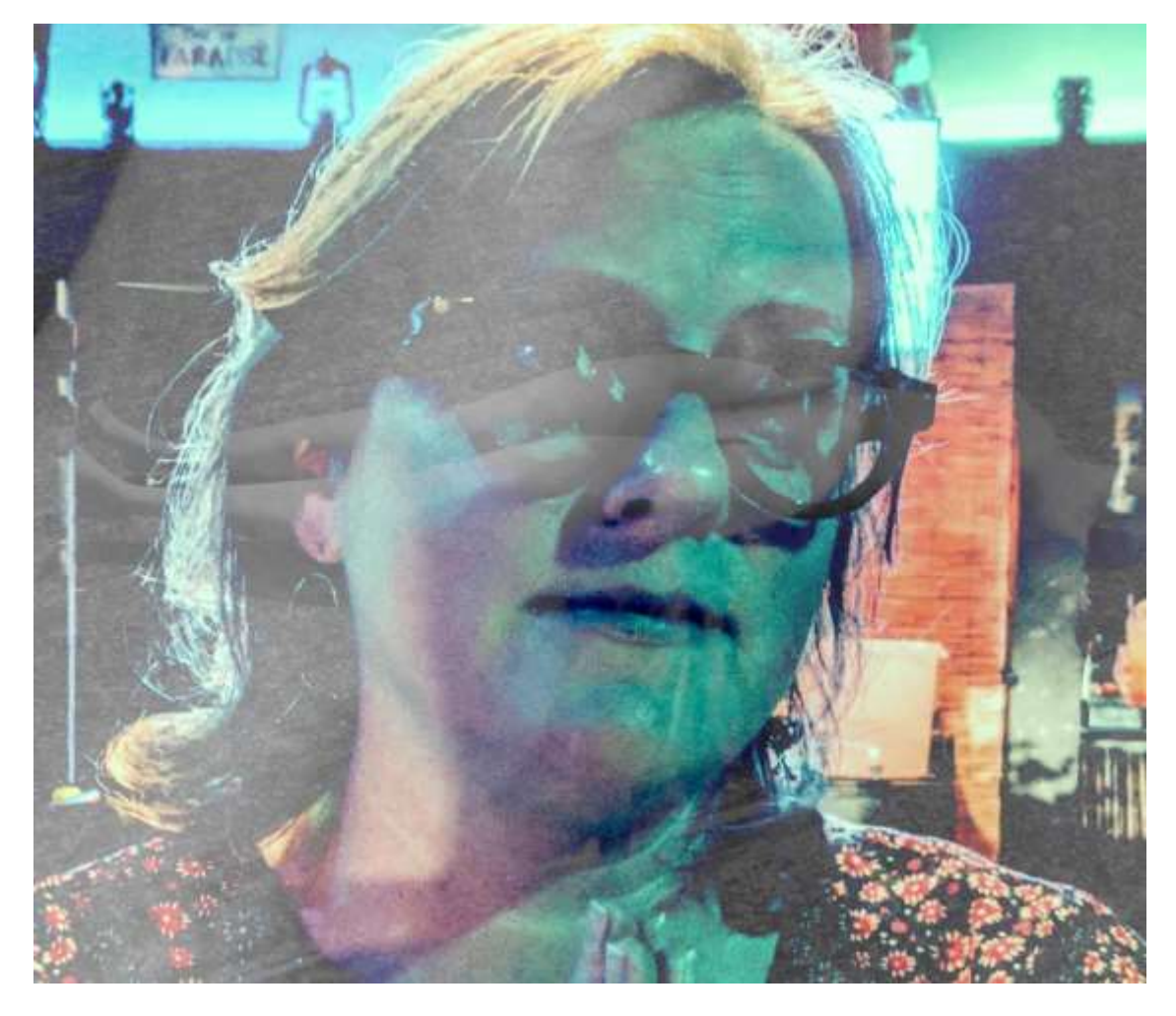
Chapter 4: Come to Your Feminist Killjoy Jesus

I see the discarded organs around me that have exploded in the warzone. I begin to take each organ, each body part, and cradle it in my hands. I carefully turn it around to study it to see what had passed through it, what got blocked, and so on. As it passed through, where was it headed? With what am I keeping up? And, for whom? And, at what cost? Sometimes the costs are great and worthy. Others are not. The costs of keeping up are always grounded in discourses that seek to striate bodies (Deleuze & Guattari, 1987).