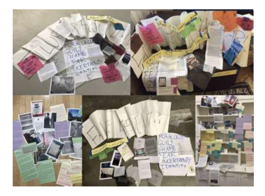
Figure 6. Wonder cabinets that were created to activate the anarchive.

Since material and thought are forces of form (Senselab, n.d.), the wunderkammer became a "technique for activating and sending forth the force of form of the event" (SenseLab, n.d), or in this case, the events created by the online and physical wunderkammern . To activate the collectively generated movements of these events, I created a series of wonder cabinets at different points throughout the analysis process (see Figure 6). Each cabinet consisted of ten to twenty objects arranged in a specific space. The objects in each of the cabinets were pieces of data collected (or assembled) during the research process. They entailed a student teacher's stuck moment entry, an excerpt from an informal conversation with a student teacher, a snippet from an audio recording, a transcript segment from a focus group conversation, a researcher memo, a cluster of photographs from a school site visit, or an artifact fashioned by either myself or the participants, among others.