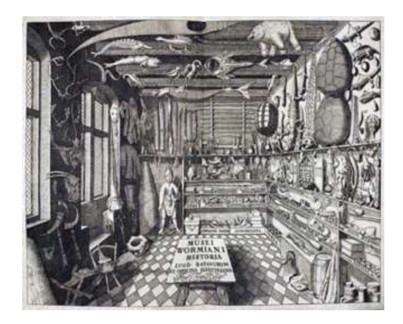
Figure 3. Wonder cabinet.

As a "synaesthetic [sic] hodgepodge of mingling smells, textures, and colours [sic]" (Maclure, 2013, p. 177)—where unpredictable and eclectic associations mingle in "unholy mixture" (Lecerle, 2002, as cited in MacLure, 2013)—the concept of the wunderkammer bears witness to collection as a form of inquiry and invokes receptivity and experimentation to "bodies of knowledge whose contours are constantly shifting and expanding" (MacLure, 2013, p. 180).