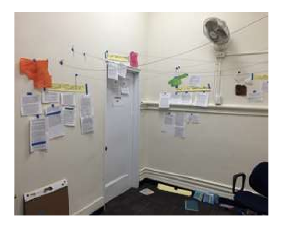
Figure 2. Materialized (i.e., physical) Wunderkammer.

Wunderkammern , or wonder cabinets, as MacLure (2013) explains, originated in 16th- and 17th-century Europe (see Figure 3). Ranging in size from compact cupboards to large rooms, wunderkammern were spaces where the broad-ranging collections of scholars, princes, rich priests, or merchants could be displayed and (be)held. According to MacLure (2013):