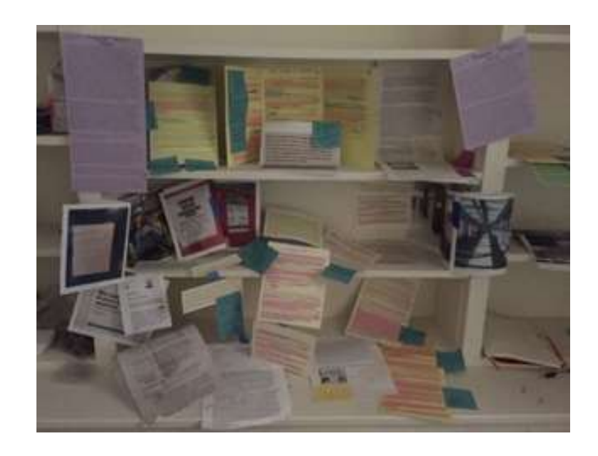
Figure 9. Improvising with lighting. Data in darkness.