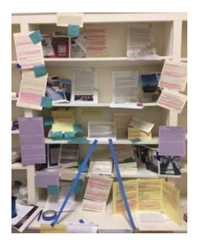
Figure 8. Using blue painter's tape to affix data pieces in wonder cabinet.

Across the iterations of each anarchival mapping, or staging, I tinkered with diverse forms, arrangements, and locations. Specifically, I assembled the various cabinets in different spaces: an office bookcase, a school parking lot, a living room couch, or an empty school entrance (See Figure 6). While each of these spaces was chosen because it coincided with a location where a student teacher experienced his or her "stuck moment", this experimentation with space was intentional: I wanted to disorient myself from what Deleuze and Guattari (1987) call "interpretosis" (p. 114), or a search for uniform meaning. In each of these different spaces, and once again culling advice from SenseLab, I "walked" in/around/through the artifacts, "hung out" with the materials, "traced" it with my fingers, and even "meditated" among the data, noting the thoughts that fluttered in and out of my mind. Whenever possible, I played with lighting and experimented with darkness and lightness (see Figures 9 and 10) to sense how the data might be transformed: Did it glow (MacLure, 2013) differently? Did some artifacts resonate more brightly than others?