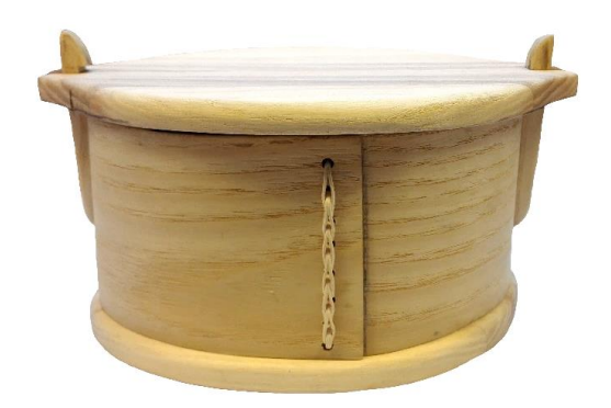
Figure 1. A bentwood box made by June as a model for the students' craft-based design practice.

Each student made a traditional bentwood box, with unique variations in his/her selections of the wood (ash or beech), size, shape, overlap, stitching (rattan or leather thread), lid and locking mechanism for the box. To complete this challenging technique, straight wood was soaked in water and bent into an oval or round shape, making a permanent change to the character of the material. The overlapping wood sections were glued and stitched, and a bottom, a lid and locking mechanisms were attached. Finally, the surfaces were treated with oil (Figure 1). The project was theoretically sampled for its challenging craft in materials, based on Nielsen and Brænnes' (2013) description of the development of design literacy through making in materials in the context of what support environmental sustainability. The teachers had experience in teaching woodwork, but not in teaching the environmental contexts. June had signed up on a list for teachers interested in participating in the research project, which involved getting help in developing DfS in their educational practice. The case was designed to embed experiential learning of DfS into the student's woodwork, thereby developing their design literacy for sustainability.