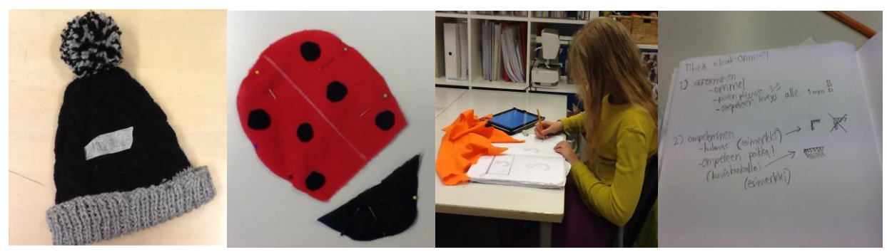
Figure 1a-1d. An example of categorizing the artefact (1a), the process (1b), the reflection (1c), and the content of learning (1d).

The third sub-code was reflection, which contained visual observations of the student her/himself, used equipment, emotions, development and social relationships. Images incorporated information about factors behind or alongside the learning task. The fourth sub-code was the content of learning, which consisted of images focusing the learned pieces of information (theory, technique), which the student judged to be important (see Figure 1a-1d).